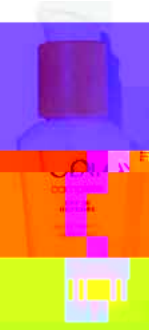
Olay Complete Defense Daily UV Moisturizer SPF30, $15, ulta.com TEXT TO BUY: DERM2 AT 58259